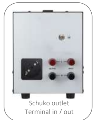
Schuko outlet Terminal in / out