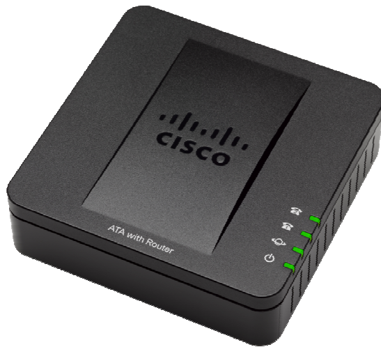
Figure 2. Ports on Cisco SPA122 ATA with Router