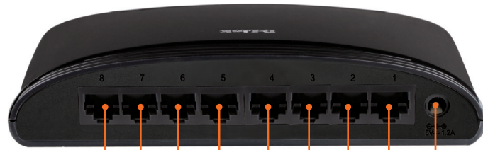
8 RJ-45 10/100 BASE-TX PORTS Connects to computers, print servers, or network storage